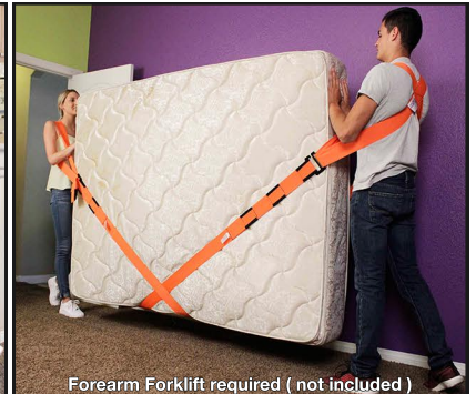
Forearm Forklift required (not included)