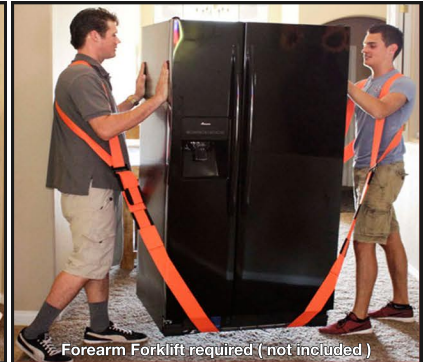
Forearm Forklift required (not included)