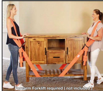
Forearm Forklift required (not included)