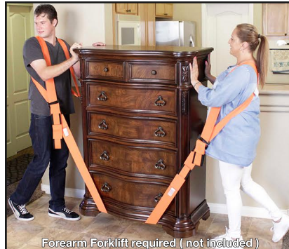
Forearm Forklift required (not included)